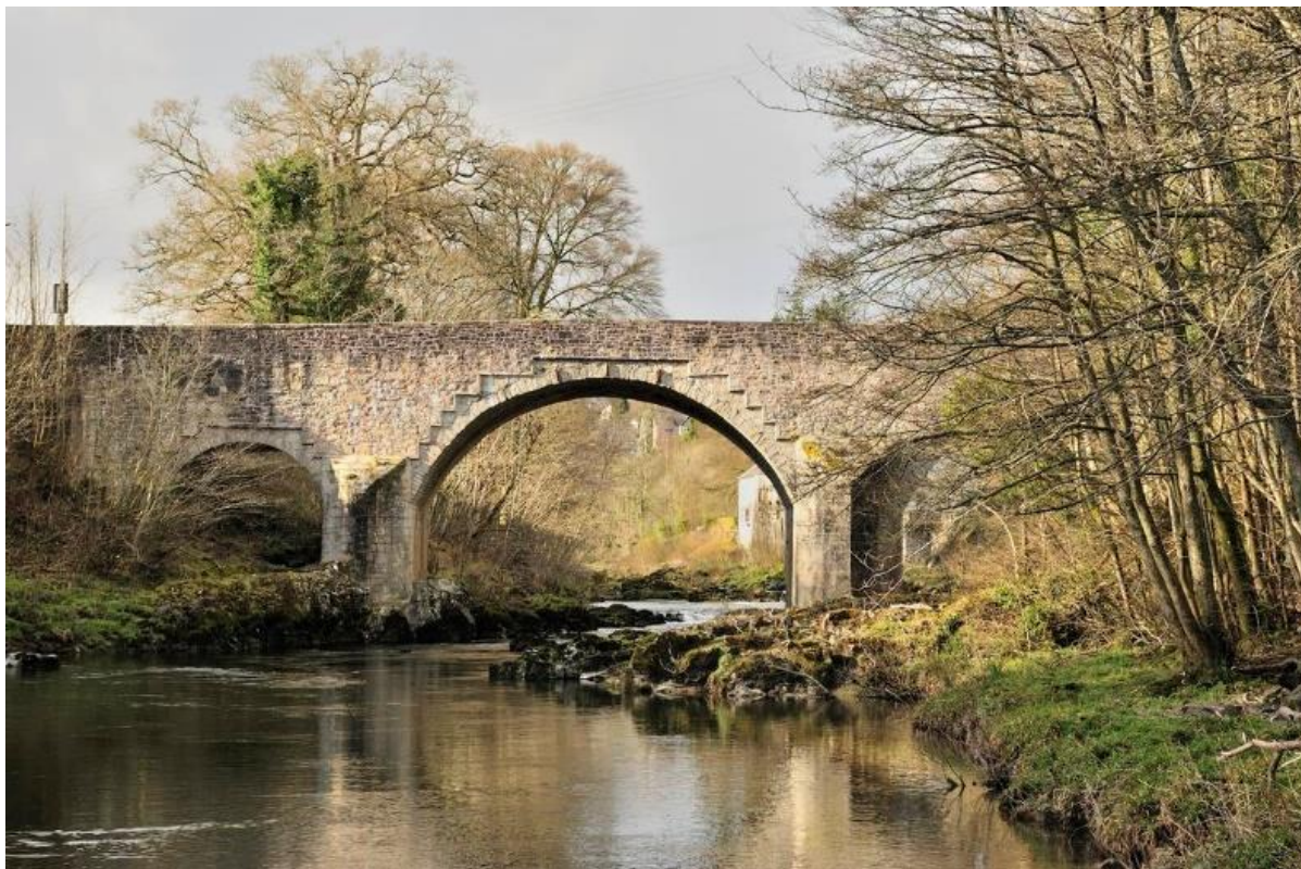
Basalt lavas under Skippers Bridge on the River Esk near Langholm

The role of individual entrepreneurialism and planning is also evident in the landscape, with planned and semi-planned villages of the last two centuries being traditional features. Newton Stewart was the first planned village in the region, founded by William Stewart in 1677. Gatehouse of Fleet thrived as a cotton milling centre from the mid-18 th to 19 th Centuries, after which it declined. The industry had been established in the town by the local laird. Similarly, Garlieston was founded by the 7 th Earl of Galloway as a fishing station and trading port.