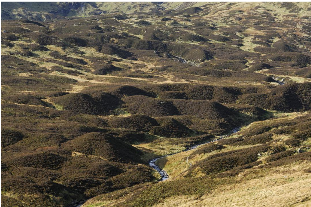
Drumlin fields near Loch Skene, Southern Uplands.

Outwith the granite areas, the landscape softens in texture, with great spreads of glacio-fluvial deposits, especially in the lower Dee valley which supports some of the most productive dairy farms in Scotland. Glacio-fluvial drift is widespread in the southern uplands and contributes to the smoothly contoured slopes. Within these areas of deposited material are the distinct drumlin landforms. These were created as an ice sheet carrying till at its base crossed an obstacle such as a boulder which would not be dislodged, obstructing the smooth flow of the glacier. Till became lodged around such obstacles and was streamlined in the direction of glacier flow as the ice moved over the obstacle, creating the distinct landforms still evident today.