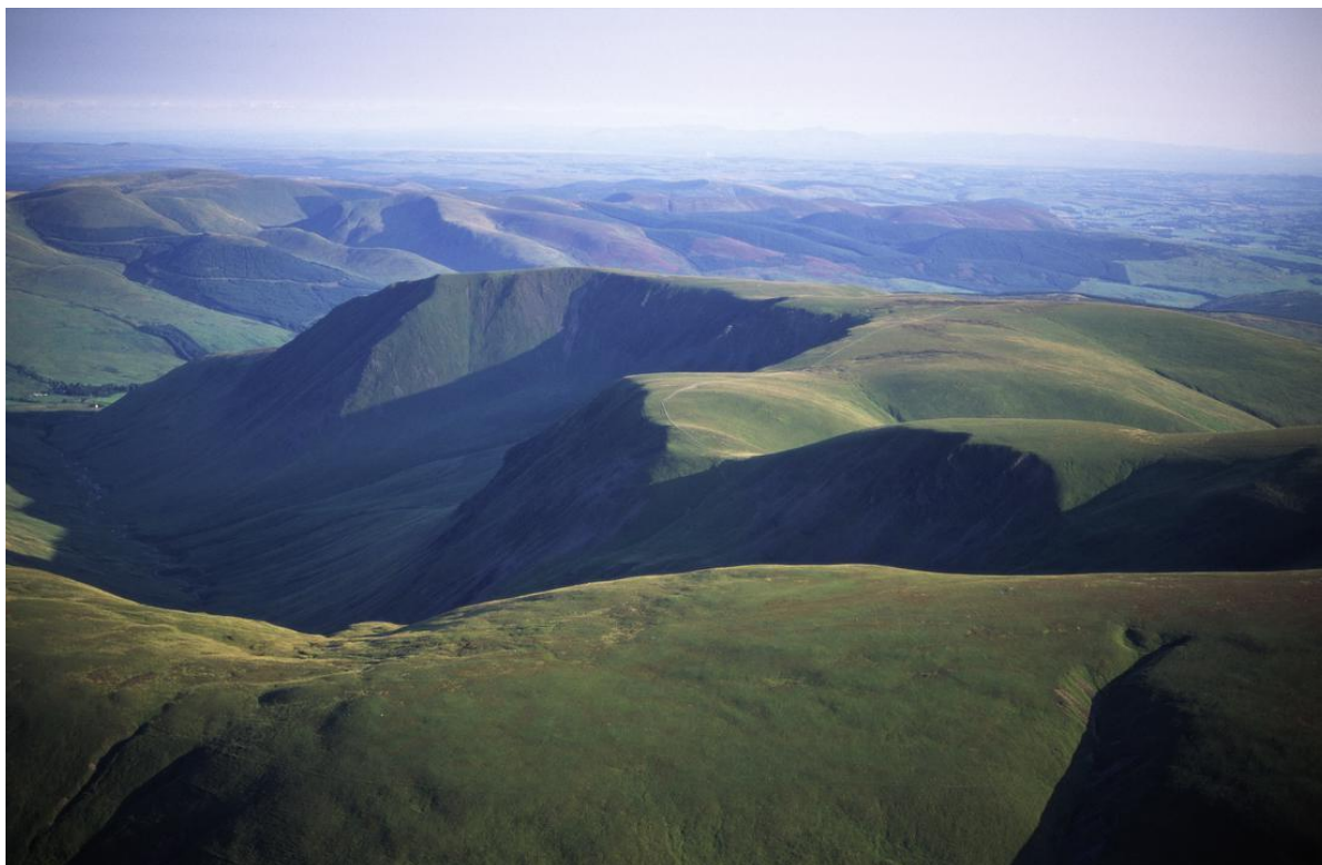
The Blackhope valley near Moffat.

The land cover of Dumfries and Galloway has developed through a combination of complex natural processes and human intervention or management. Many areas of land cover support a diverse range of flora and fauna and are of high nature conservation value. Other places are important for their geological and geomorphological features.