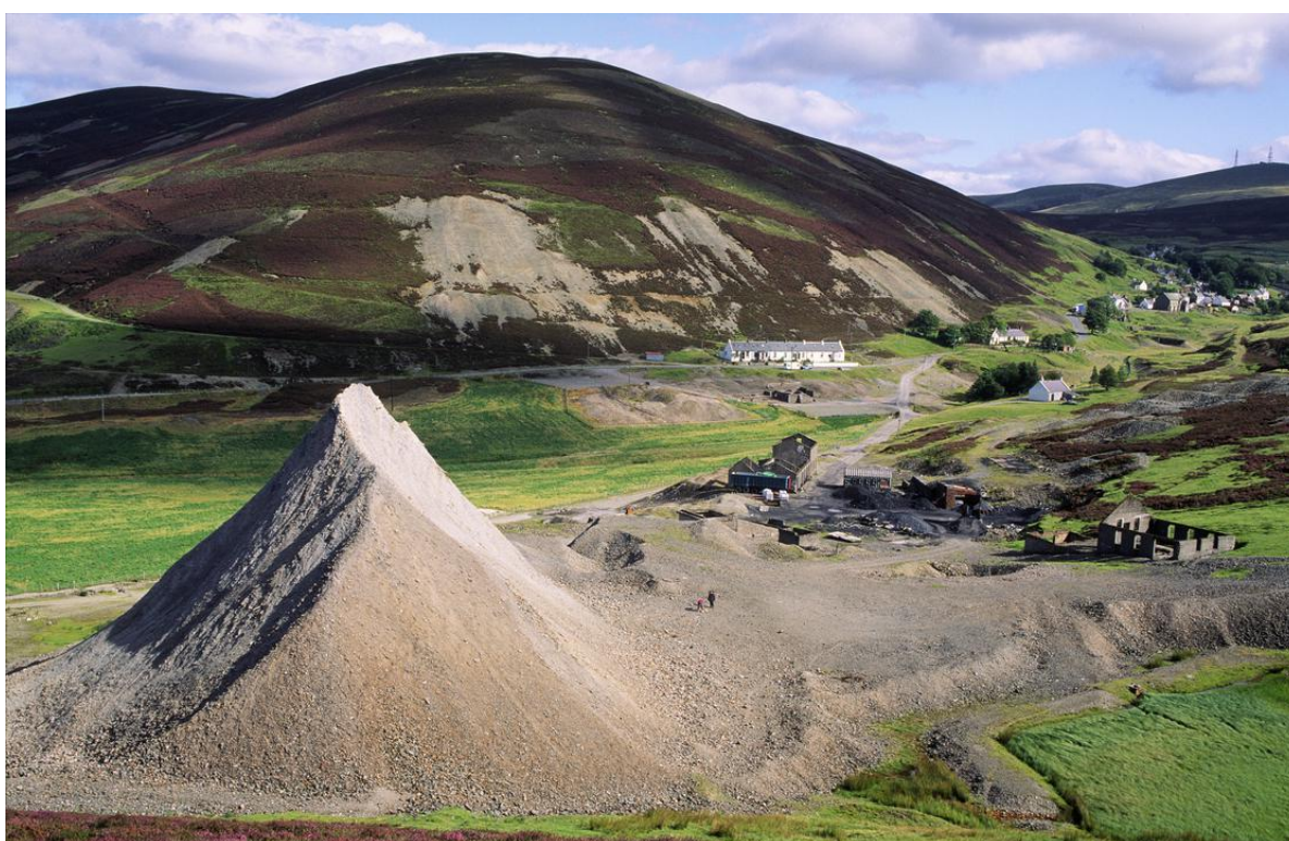
Spoil heaps at Wanlockhead.

The legacy of small-scale mining is often difficult to detect in today's landscape. Most noticeable perhaps are the distinctive settlements that have developed because of mining. The local effects of lead and coal mining are, however, significant features in the landscape, especially if not restored. The large opencast site at Kirkconnel in Upper Nithsdale for example, which went bankrupt in the early 2000s and has not been reinstated, is still highly visible. Close by are the spoil and slag heaps which appear raw against the green hillsides. Lead mining also resulted in many associated features in the landscape: silting lagoons, smelting chimneys and water channels. The importance of this industrial heritage has been recognised in recent years with the development of a lead mining museum at Wanlockhead and the designation of the Woodhead mining village as a Scheduled Monument, along with the mines at Pibble Hill near Creetown. The Wanlockhead mining complex is the largest Scheduled Monument in Dumfries and Galloway.