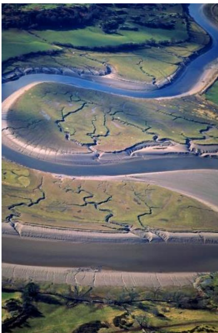
Saltmarsh on the Ure water.

Unimproved semi-natural grassland communities are extensive in hill areas and these include some flower rich meadows which are a significant feature in the region's landscape, particularly when in full flower. Some grasslands are protected as SSSIs including Lag Meadow in Nithsdale. This is one of the best examples of unimproved grassland in the district, and is the only grassland SSSI within the region to be managed as traditional hay meadow.