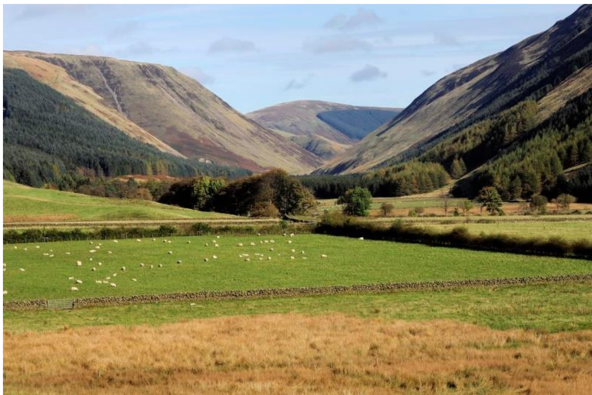
Grazing sheep and conifer plantations, Moffatdale.