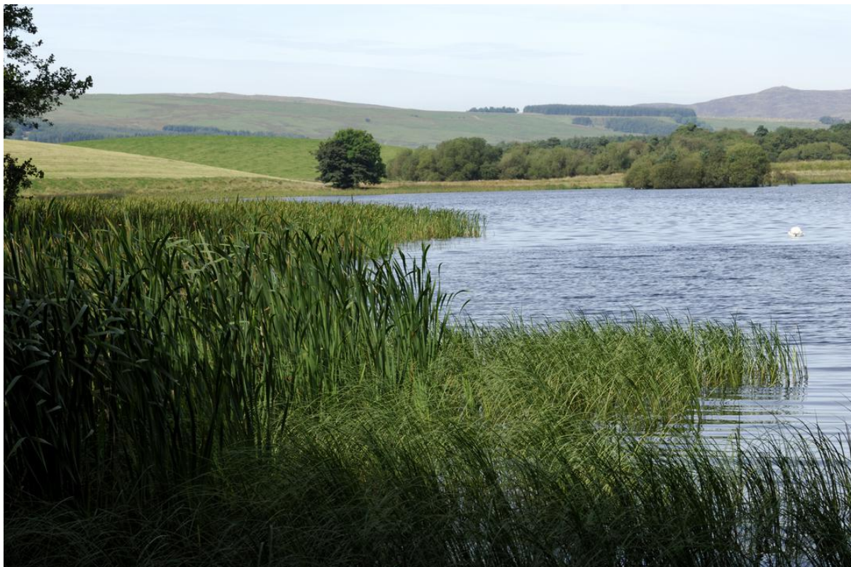
Loch, Dumfries and Galloway.

a range of wetland plants and important wild fowl habitats. In the uplands, they occupy basins and glacially carved hollows.