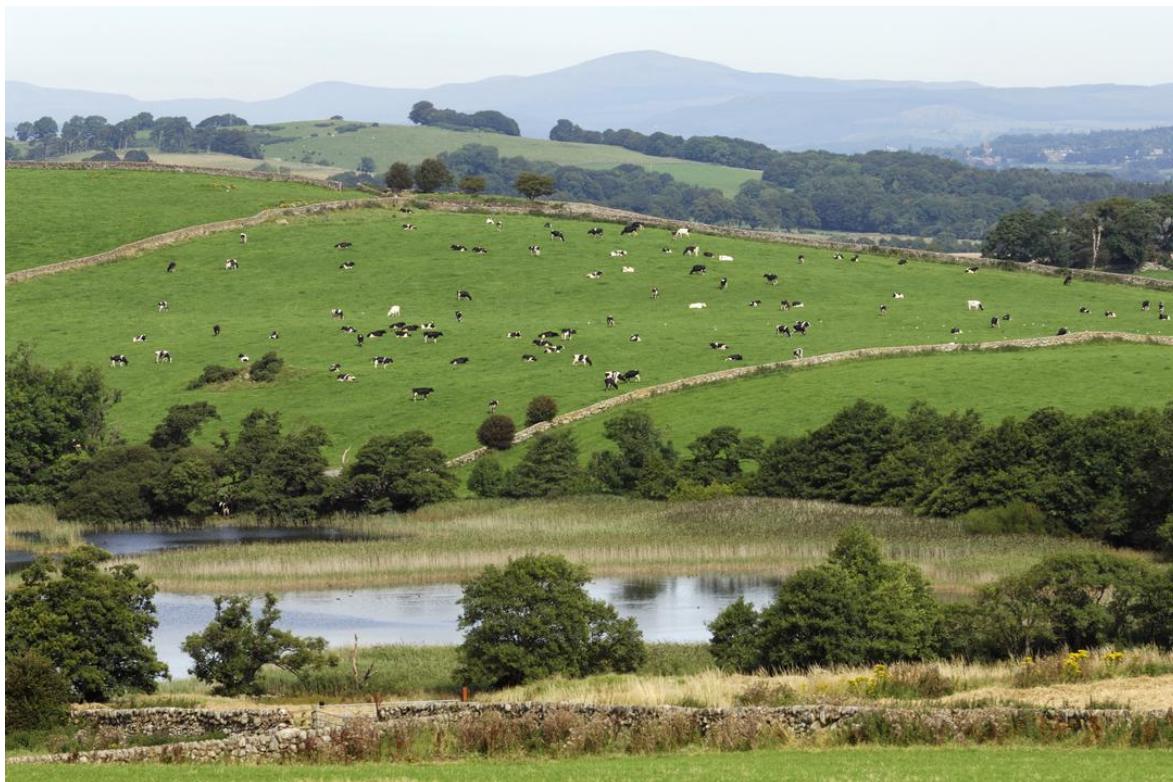
Freshwater loch and agricultural landscape, Dumfries and Galloway.

predominantly in lowland locations, for example, in the pastures around Castle Douglas, sheltered estuaries and along the main river valleys such as the Annan, Nith and Cree. Land class 4 is slightly more limited than the above and tends to be found as upland extensions of class 3. Much of the land area is suited only to improved grassland or rough grazing, (classes 5 and 6). Significant parts of the uplands face severe limitations for agriculture and are therefore only suited to rough grazing, although small pockets of land may be suited to limited improvements.