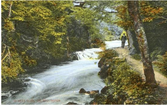
Ness Glen 1875