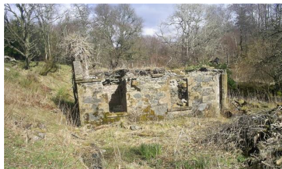
Cottage before repair