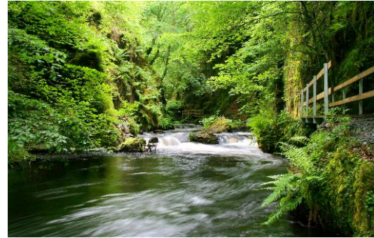
Ness Glen 2018